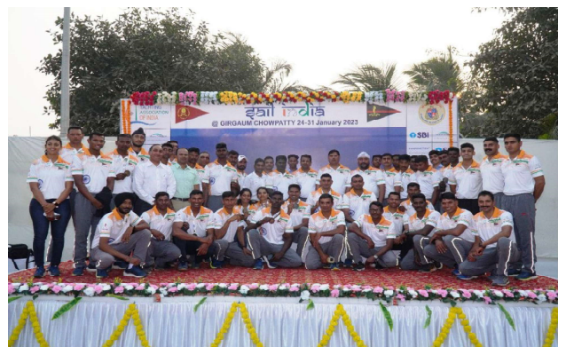
A group photo of the winners of YAI Sail India 2023.